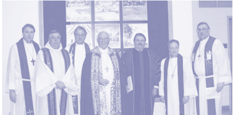
Worship Service at 50th Birthday Celebration

Other events planned to celebrate our 50 th anniversary include a LuHi Family Habitat for Humanity Build, a cruise to Bermuda with LuHi family and friends, a Summer LuHi Family Fun Day on Campus, an All-School Reunion in October 2010, and an old fashioned LuHi Christmas Celebration in December. The LuHi Family steps into the next 50 years rooted in faith, thankful for the generations who contributed to our rich history... and growing in excellence as we look forward to carrying on this important legacy.