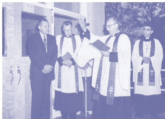
Opening Prayer Service in 1960

Since its inception, LuHi has continually strived to update facilities and over the years additions to the LuHi campus have included the Chapel/Performing Arts Center, a Student Center/ Dining Hall, Prayer